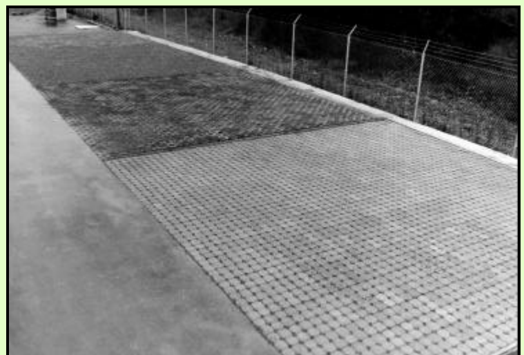
Figure 1. Different types of permeable pavement. From top left: reinforced gravel and grass pavement, reinforced grass pavement, 60% impervious concrete blocks with grass, 90% impervious blocks with gravel.

A control stall was constructed out of traditional asphalt. A system of pipes, gutters, and automatic sampling gauges was installed to collect and measure the quantity and chemistry of surface runoff and subsurface infiltrate. Figure 2 shows a schematic of the test facility.